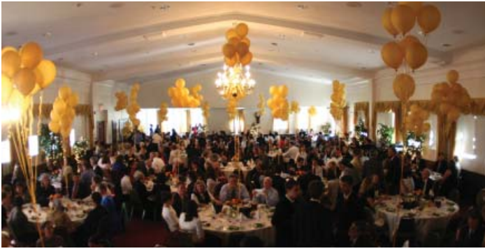
The auditorium was filled to capacity for the Parent Appreciation Dinner.

each other's journals. Meanwhile, the '09ers industriously cleaned up and prepared for the big day ahead. Saturday morning arrived quickly for all of us.