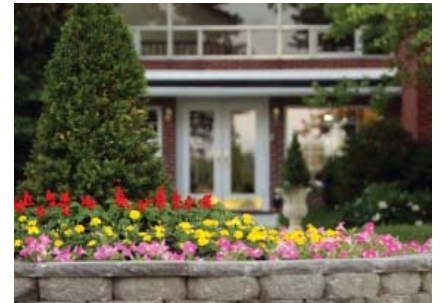
The new circular garden area brings life and color to the front lawn.